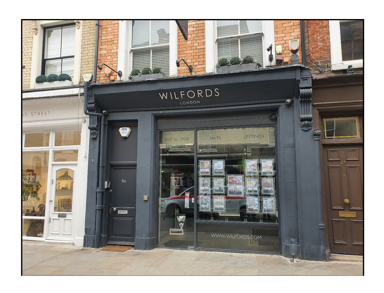
6 Holland Street, W8 4LT