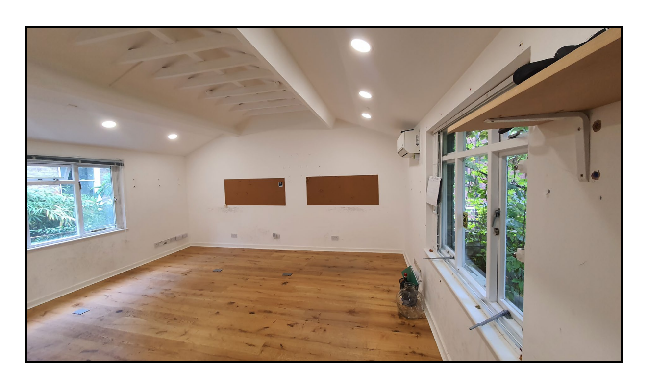
39a Tavistock Road, W11 1AR

Approx 1,000 sq ft 92.9 sq m gross internal area